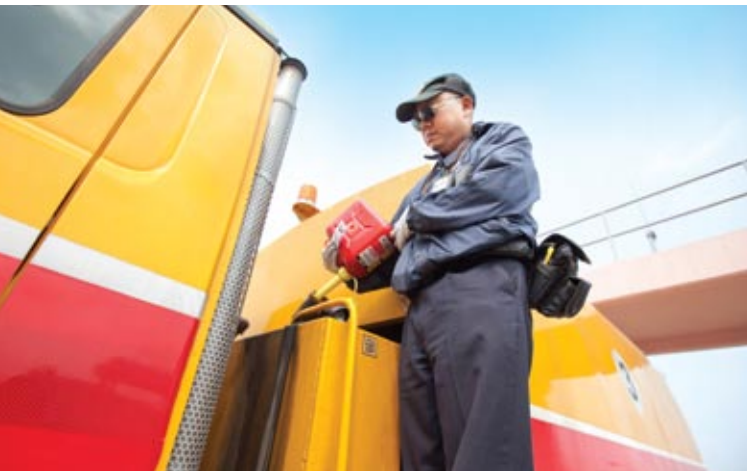
All of the Airport Authority's diesel vehicles now run on B5 biodiesel.