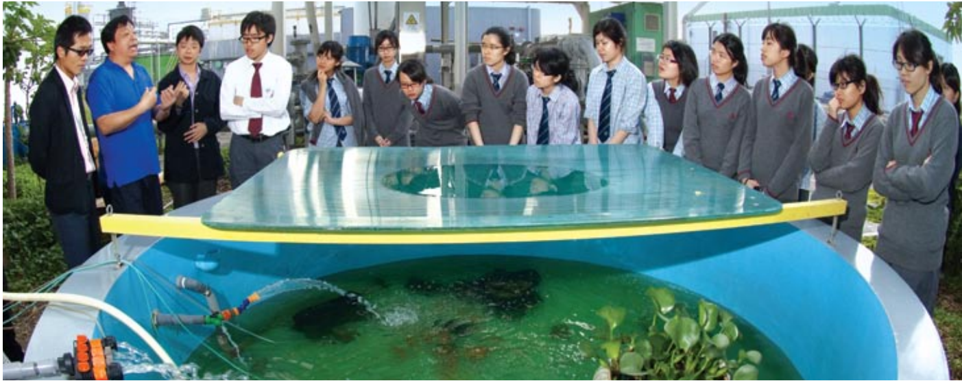
A visit to the wastewater treatment plant helps students understand the many environmental protection measures in place at HKIA.

through the Business Environment Council's Corporate Sustainability For Schools (CS4Schools) programme, and the annual roof-greening and organic farming competition that is organised by the Hong Chi Association to teach children about climate change and the importance of nature conservation. During the year, we also staged environmental exhibitions at HKIA and other high-traffic locations in Hong Kong. These initiatives encourage young people to love the earth and understand the need for environmental protection.