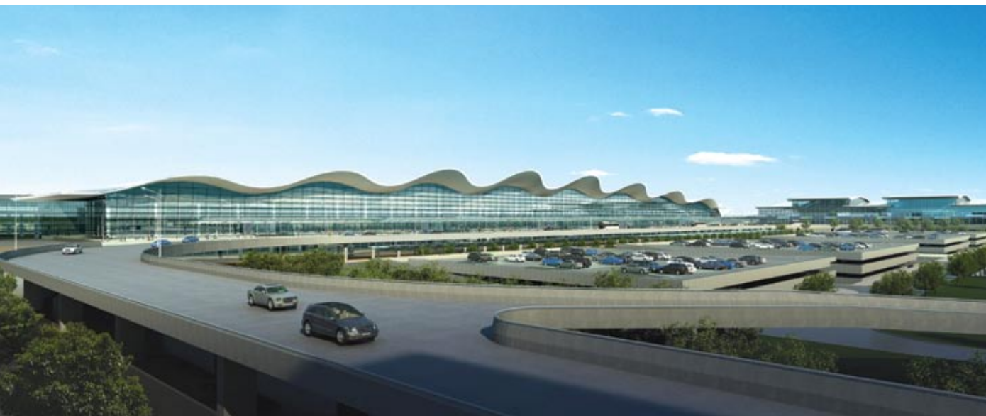
During the year, work continued on the expansion of the domestic terminal at Hangzhou Xiaoshan International Airport, shown here in an artist's rendering.