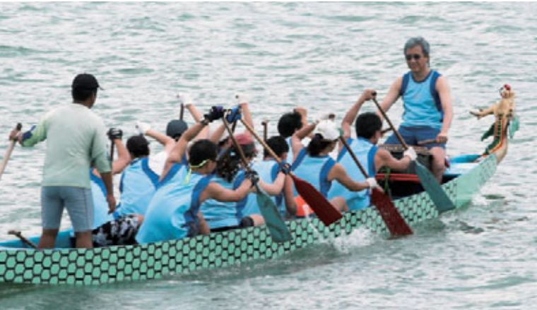
We encourage staff to participate in all health-related activities.