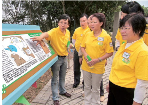
Featuring beautiful coastal scenery, the Airport Trail has become popular with the local community.

Our presence in Zhuhai Airport and Hangzhou Xiaoshan International Airport, which started in 2006/07, also gave us a platform from which we could share our expertise with our counterparts in Mainland China.